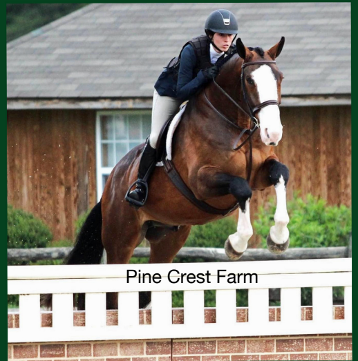
Pine Crest Farm