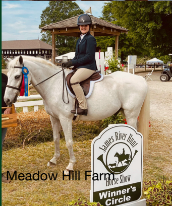
Meadow Hill Farm