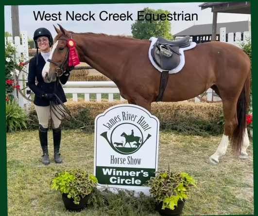
West Neck Creek Equestrian

Thank you to all our exhibitors & sponsors! -James River Hunt