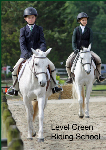
Level Green Riding School